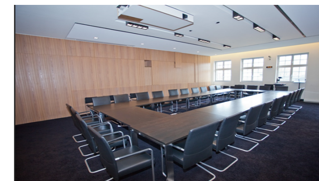
Conference room "AS-Saal" at Edmund-Siemers-Allee 1