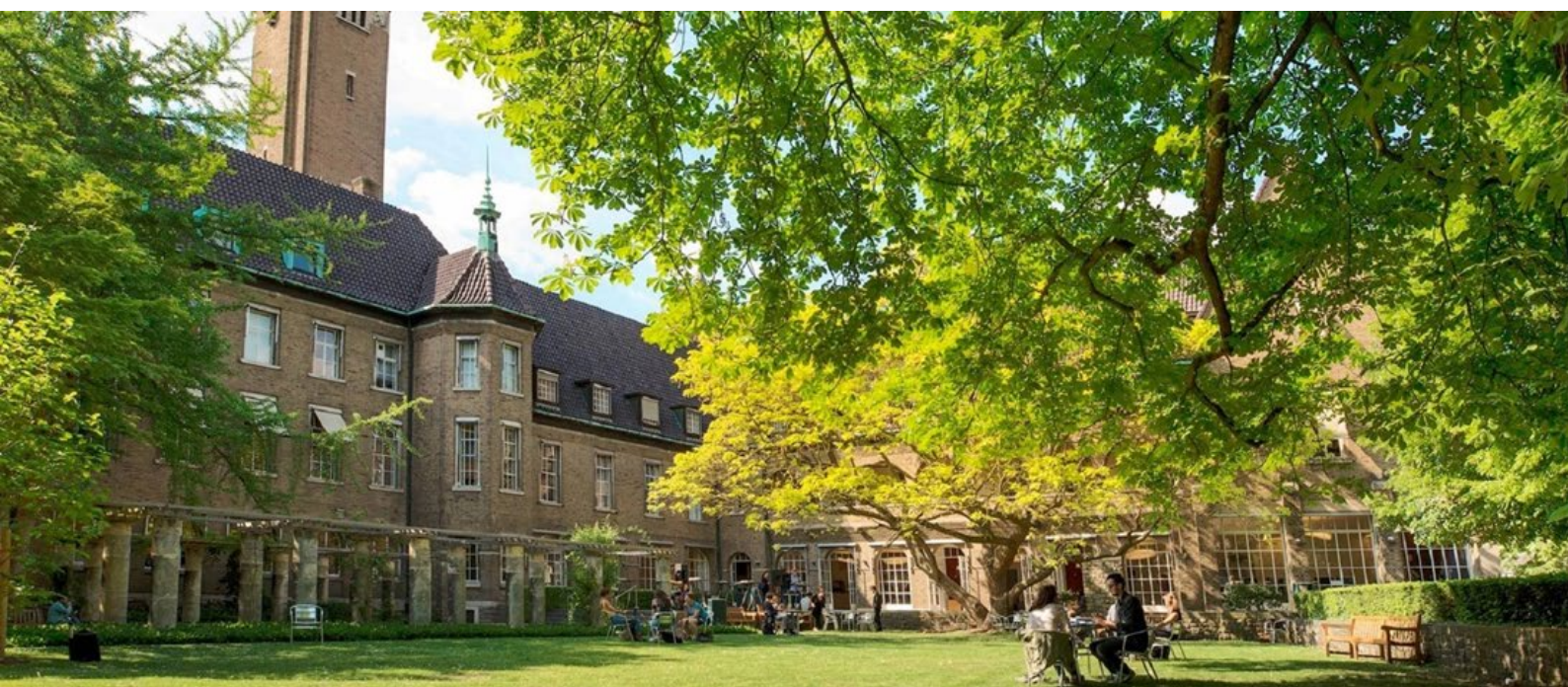
Maastricht Law Faculty